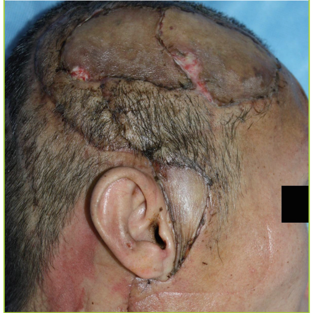
Fig. 5. Photograph 10 months postoperatively

All flaps survived well and the skin graft was successful. In addition, there were no further signs of infection.