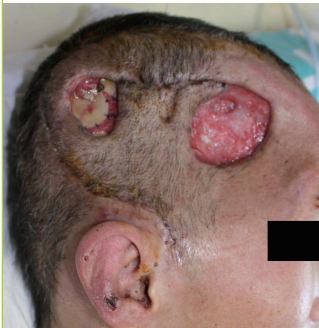
Fig. 2. Flap inseting

There was a loss of the right temporal area of the cranium and a scalp defect of 4 \times 3 cm in the posterior area and 6 \times 5 cm in the anterior area, each of which were tunneled and connected. In addition, there was an exposure of the artificial dura graft that had been previously applied surgically, which was accompanied by a chronic infection.