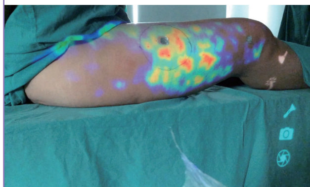
Fig. 4. Thermal image projected over the thigh surface

The idea of using augmented reality for reconstructive surgical planning has been previously explored. A near-infrared vein visualization device has been utilized for the selection of a recipient vein with an intact valve in lymphatic supermicrosurgery [13], and abdominal CTA-reconstructed images have been projected over a patient's abdomen to provide a visual aid while planning a deep inferior epigastric artery perforator flap [14].