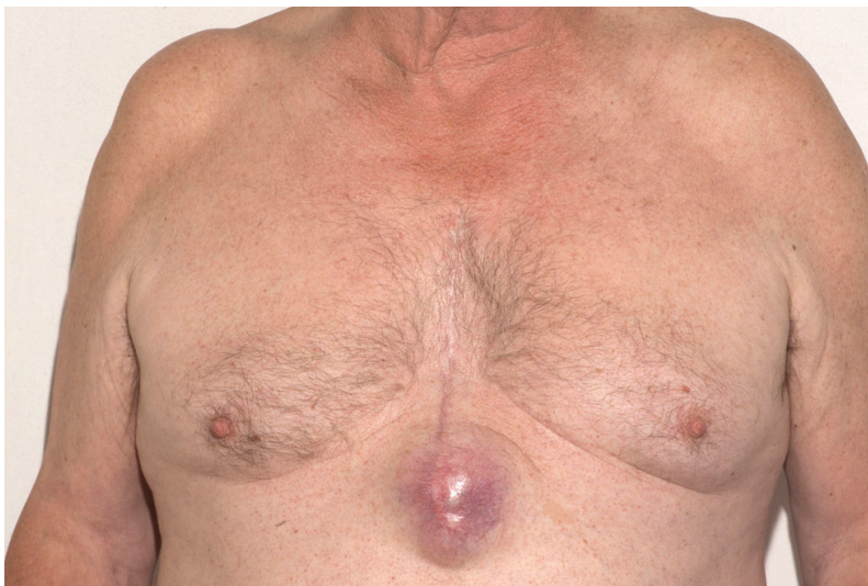
Fig. 1. Preoperative photographs showing the extent of the soft tissue sarcoma in our patient's chest wall.

Even though it is ideal to exchange any exposed material by the time definitive cover is achieved, sometimes, due to the complexity of the case this is not possible. The previously exposed case intends to demonstrate the salvage of the situation with a free flap can be a feasible option.