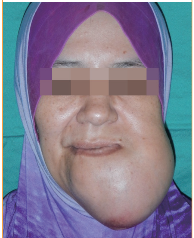
Fig. 1. A case of mandibular ameloblastoma

Mandibular resection was performed in several ways; when possible, segmental mandibulectomy with a surgical margin of 2 cm from the radiographic border of the tumor was performed, while in large tumors located around the ramus, hemimandibulectomy was performed. Immediate mandibular reconstruction with a free fibula osteocutaneous flap was performed following resection (Fig. 1). The maximum possible length of fibula bone