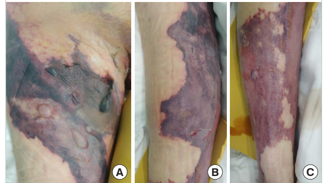
Fig. 2. Gross findings of the excised tissue

(A) Anterior proximal thigh region. (B) Anterior distal thigh region. (C) Pretibial region.