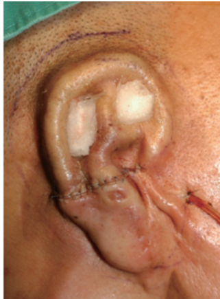
Fig. 4. An 11-year-old patient with microtia on the left side

The cartilage framework constructed as such was placed into a subcutaneous pocket through an incision located at the posterior inferior border of the vestige. After the last stitch of the skin was made, the drain was run, the flap was placed onto the frame, and adhesion was achieved. All folds of the ear were filled with petrolatum gauze in all patients.