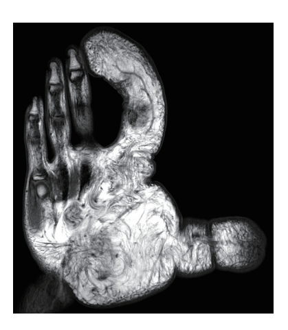
Fig. 2. Preoperative magnetic resonance image (MRI). The fibroadipose tissue showing hyperintensity on T1weighted MRI image. The density of the excessive adipose tissue is identical to that of normal subcutaneous fat tissue.

remaining three ulnar digits appeared normal.