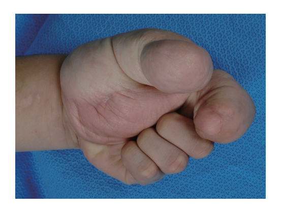
Fig. 5. Postoperative opposing photographs. Opposing difficulty improved postoperatively. The patient could pick up objects more readily than before.

Neurofibromatosis can be diagnosed by a positive family history and certain characteristic cutaneous manifestations such as café-au-lait spots on the skin and soft tissue nodules. Furthermore, because bony overgrowth and fat deposition in subcutaneous tissues, tendons, muscles, and nerves with macrodactyly are specific diagnostic features of macrodystrophia lipomatosa, it can be differentiated from other diseases that can show similar clinical features.