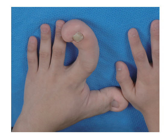
Fig. 1. Preoperative photograph. Preoperative photograph showing enlargement of the left thumb and index finger.

Plain radiographs of the patient's left hand revealed a marked increase in the thickness of the soft tissues, and the length and diameter of the corresponding metacarpals and phalanges were also increased. The