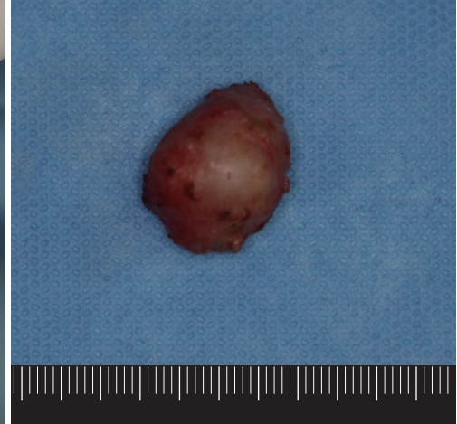
Fig. 4. Postoperative gross mass view. A 2.2 cm × 1.5 cm × 1.5 cm specimen was removed.

sulated mass was found (Fig. 3). The mass was overlying the subcutaneous and muscle layer. The mass was excised entirely, preserving normal adjacent tissue without any rupture. The specimen was 2.2 cm × 1.5 cm × 1.5 cm in size and sent to the pathology department (Fig. 4).