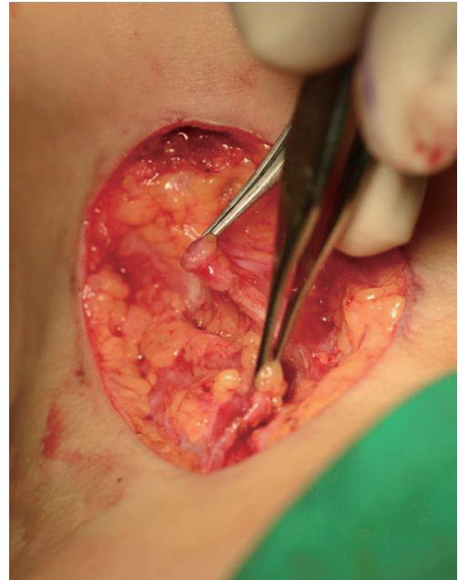
Fig. 3. Platysma flap with Z-plasty was performed for a functionally and aesthetically better prognosis.