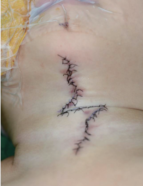
Fig. 4. Postoperative photograph. Skin closure with single Z-plasty was performed.

ascertained; however, embryologically defective fusion of the first and the second branchial arches is the most accepted hypothesis [1,2]. It is regarded as a variant of the Tessier median mandibular facial cleft and the type-30 craniofacial cleft [3]. Genetic studies are currently in progress; these studies focus on the mutation in the SIX5 gene and the deletion of the pregnancy-associated plasma protein A (PAPPA) as potential candidates, but an accurate mechanism is still unknown [4].