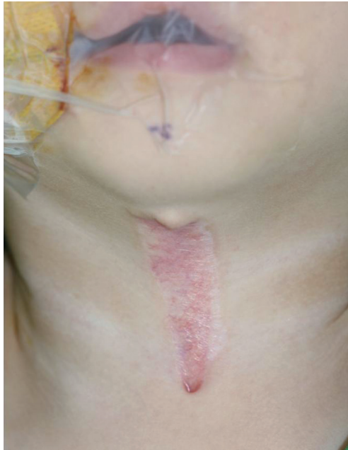
Fig. 1. Preoperative photograph shows typical characteristics of congenital midline cervical cleft.