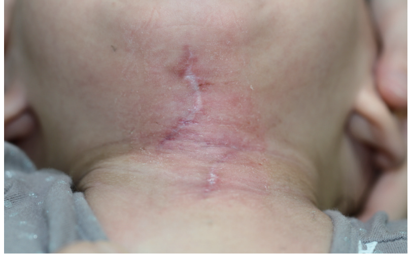
Fig. 5. Postoperative 2-month photograph. Minimal scarring was predicted.

The characteristic pathologic findings are reported as parakeratosis in the skin, the absence of skin appendages, the presence of striated muscle tissues under the skin, and the presence of respiratory epithelium or seromucinous glands [2-4]. In this case, the abovementioned histologic findings were conspicuous, but skin adnexal tissues were absent or