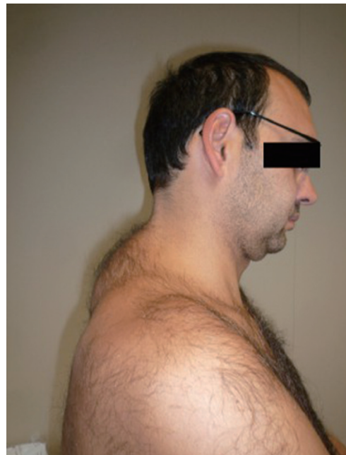
Fig. 1. Preoperative situation.

In order to document the presence of retinoblastoma, multiple endocrine neoplasia (MEN) 1 and lipomatosis were evaluated with an preoperative genetic exam to confirm the diagnosis of this rare and complex syndrome; in fact, hereditary predisposition to lipomas is observed in familial multiple lipomatosis and benign cervical lipomatosis (and can also be associated with mutations in the MEN1 and phosphatase and TENsin homolog