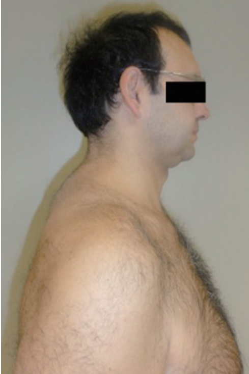
Fig. 4. Cosmetic outcome.

advances has been the use of the tumescent technique for removing fat. Also reporting the experience of previous works, Stebbins et al. [3] have stated that although liposuction has been used successfully to remove or reduce large lipomas, there are certain instances when complete excision is inhibited by lipomas with a more significant fibrous component. In this setting, these authors have asserted that laser lipolysis can be used to lyse fibrous connections of the lipoma, while liquefying the fat. It has been estimated that approximately 10% to 18% of the lipomas are incompletely removed using laser lipolysis with or without subsequent liposuction. However, given the minimal invasivity of the procedure, retreatment is usually well-tolerated.