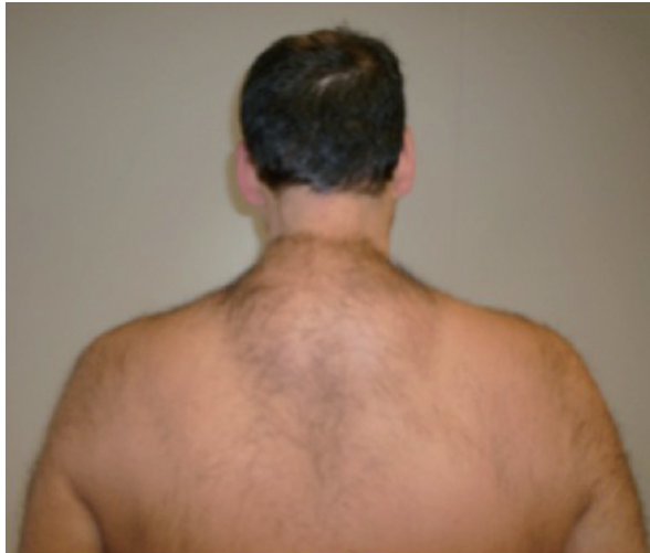
Fig. 2. Preoperative situation.

[PTEN] genes). In addition, a recent report indicates that a few patients with hereditary retinoblastoma also have lipomas. In the pedigree presented in this patient, the autosomal dominant transmission of multiple lipomas is linked to a mutant retinoblastoma (RB) 1 allele. Therefore, early diagnosis is very important because the progeny is surely affected.