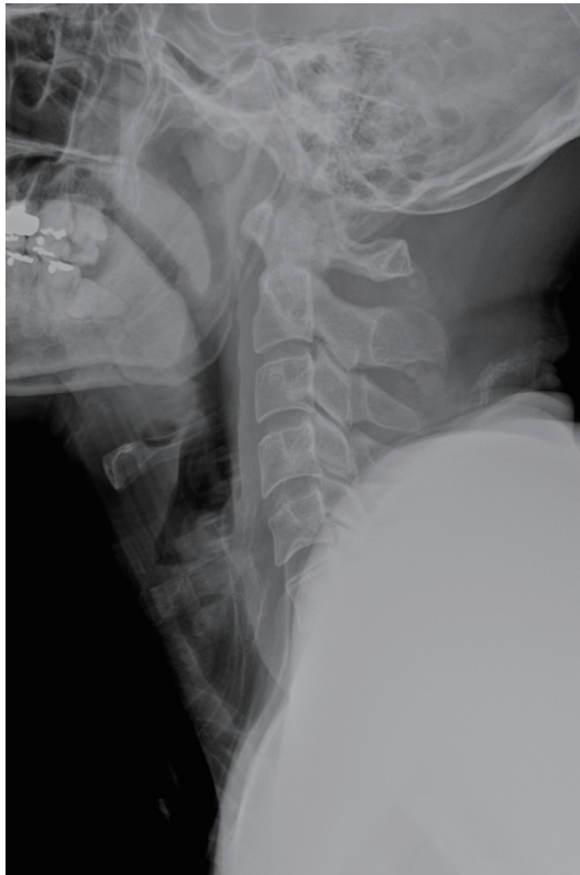
Fig. 2. Routine lateral radiography showed no definite fracture line.

room complaining of painful swelling in the left mandible area after a car accident. He was in an alert mental state. Physical examination revealed severe tenderness over the left mandible angle region. Occlusal disturbance was noted. Plain radiography demonstrated a left angle fracture of the mandible (Fig. 1). An X-ray of the neck did not show a definite fracture (Fig. 2). The mandibular fracture was treated by open reduction and internal fixation with a plate (Fig. 3). Two days after the operation for the mandibular fracture, he complained of dyspnea that suddenly developed. Physical examination revealed crepitus and pain in the anterior neck upon turning the face. Pharyngolaryngeal edema was identified. The patient was transferred to the intensive care unit. After 5 days of close observation, his symptoms subsided. He underwent a computed tomography (CT) scan of the neck to rule out the presence of damage to airway structures. CT demonstrated a slightly displaced fracture of the hyoid bone between the left greater horn and the body (Fig. 4). There was no perforation in the larynx or pharynx, and the cervical spines and other airway structures were normal. Direct laryngoscopy was normal. He was diagnosed with a fracture of the hyoid bone. Management was conservatively. Fortunately, his symptoms disappeared after 2 weeks.