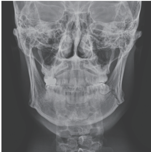
Fig. 1. A postero-anterior view of mandible revealed a left angle fracture.

A 32-year-old man presented to our emergency