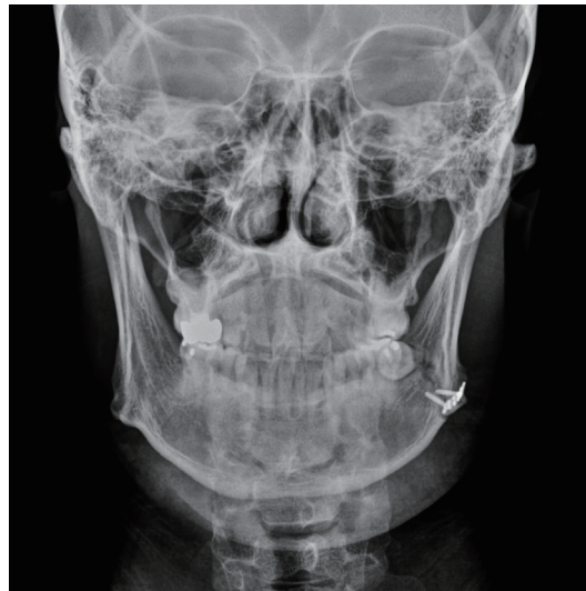
Fig. 3. A postoperative view of a mandibular fracture.