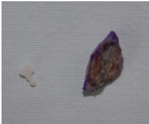
Fig. 3. Including calcified lesion, 1.0 x 0.8 cm sized mass excision was performed.