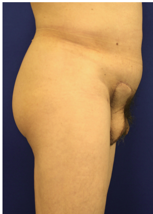
Fig. 5. This figure contains a lateral view three months after the operation showing that the wounds had healed well and that a good aesthetic result was achieved.

Second, by choosing the pedicled ORAM flap over the pedicled ALT flap, we were able to raise the ORAM flap simultaneously on the contralateral side