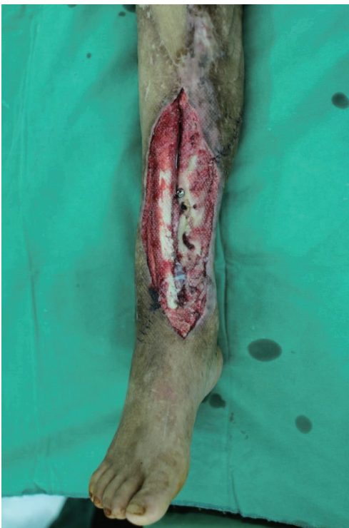
Fig. 2. A 58-year-old man injured in a motorcycle accident, preoperative: hardware was exposed along with his bone and soft tissue.

When he transferred, he had an open wound on an open fracture at one-third of the distal shaft of the tibia with exposure of the bone and hardware and continuous draining overlying his tibia fracture site (Fig. 2). Pseudomonas grew from the open pus culture overlying his wound. Antibiotic therapy failed, and the infected nonunion of his fracture was diagnosed. A number of debridement procedures were performed. After observing the little infection wound, we prepared for reconstruction with a latissimus dorsi myocutaneous free flap.