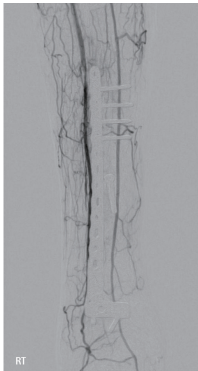
Fig. 3. Angiogram obtained prior to free flap reconstruction: diffuse atrophic change in the right lower extremity and no obvious stenosis of the right posterior tibial artery and proximal portion of the peroneal artery were observed. RT, right leg.