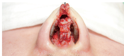
Fig. 2. Intraoperative view. The silicone implant was removed. The only graft and columellar strut graft are shown.