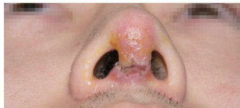
Fig. 1. Preoperative view. Erythema on the nasal tip and columella is shown. The incision wound was disrupted.

For infection control, 400 mg of ciprofloxacin was administered twice a day and massive irrigation was performed. However, fever occurred and symptoms related to sepsis appeared on the third day (Table 1). Therefore, 1,500 mg of amoxicillin was prescribed as a broad-spectrum antibiotic pending the results of the susceptibility test. Five days after the