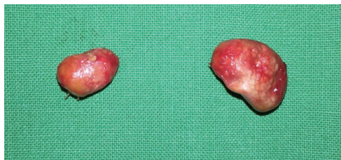
Fig. 3. The masses were excised without rupture, and the right mass was slightly larger than the left one.

Bilateral facial masses are not commonly encountered. If there are symmetrically bilateral